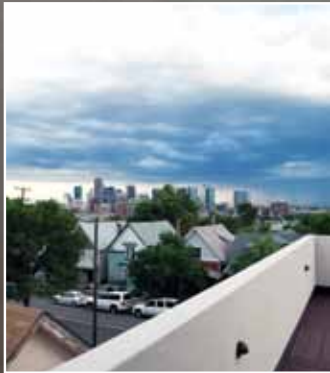
The Erickson's rooftop patio provides amazing views of LoHi and Denver beyond.